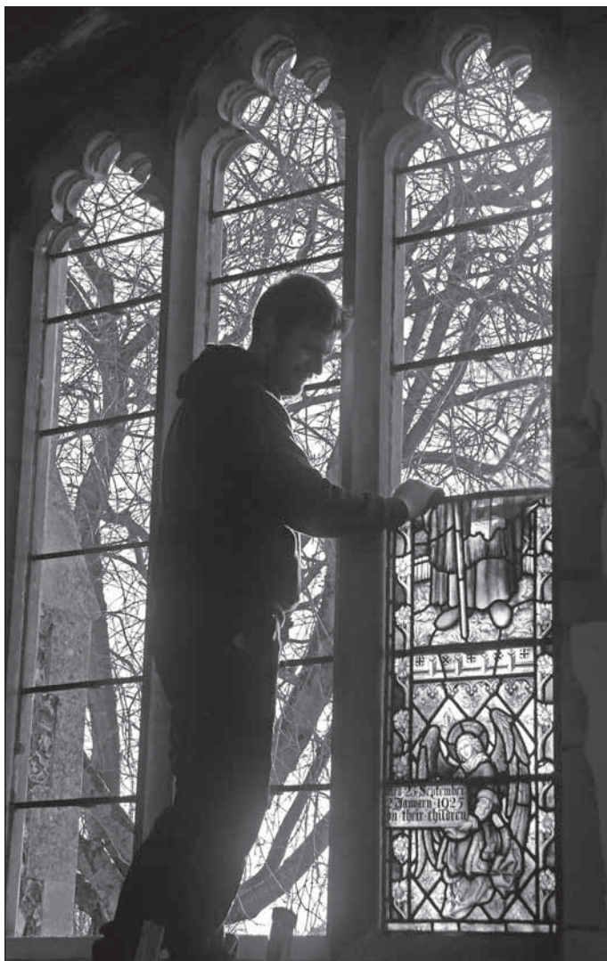
Restoration work is being carried out on some of the church's ancient stained glass windows. An expert is pictured removing the glass from a window in the south aisle.