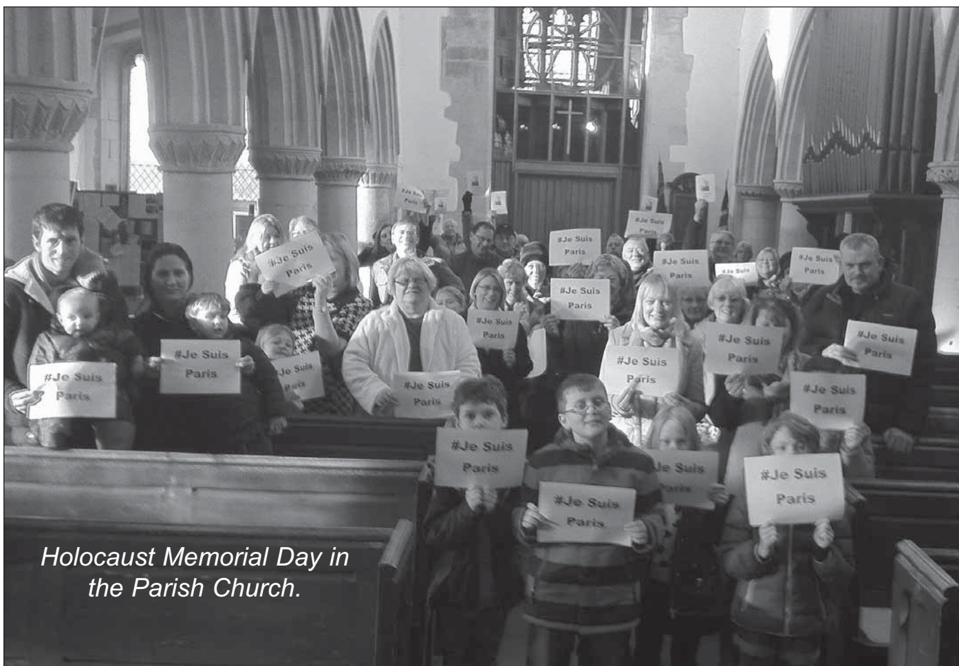
Holocaust Memorial Day in the Parish Church.