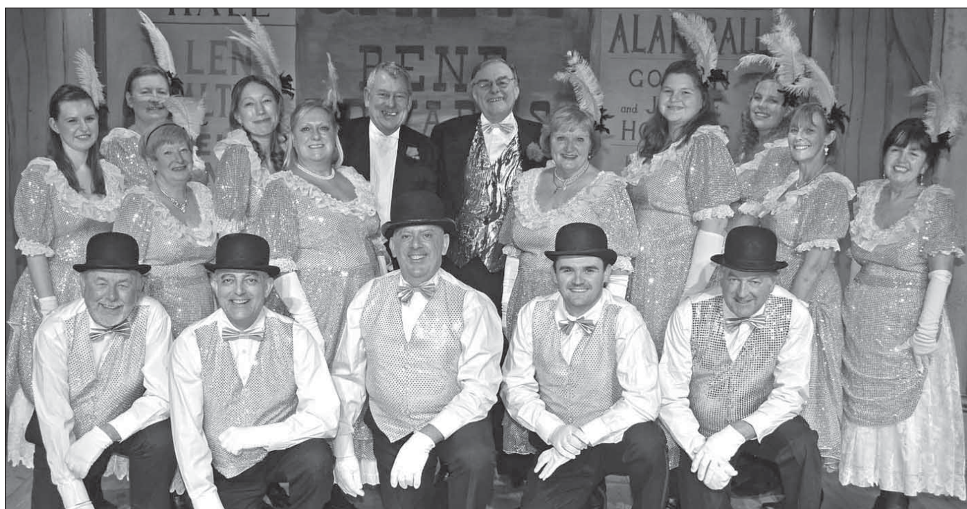
The cast, chairman and 'orchestra' of the Kimpton Players' 50th Old Time Music Hall.