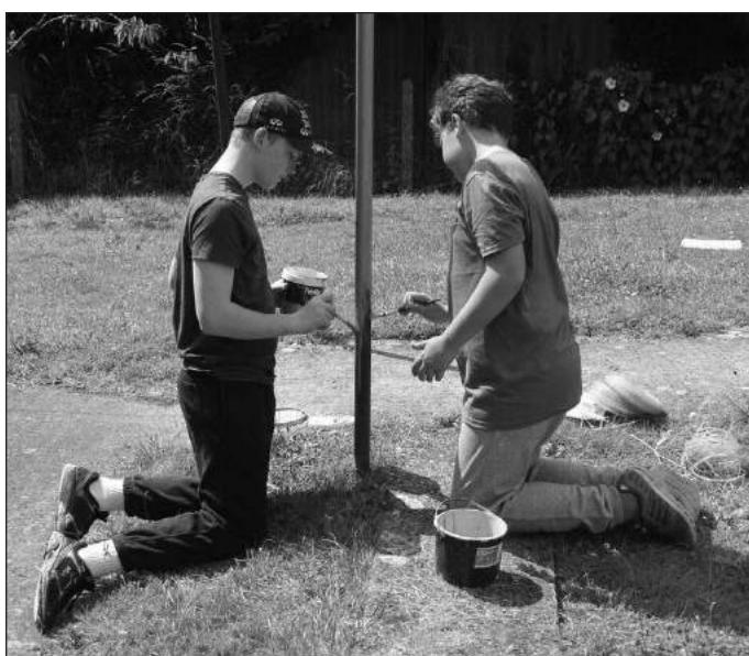
Noise Project