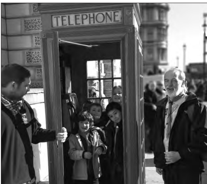
How many Scouts can you get in a phone box? Kimpton Scouts enjoyed their visit to London. The victorious Green Beret team are pictured at the top of the page.

In coming 6th Team Manticore were highest placed team in the Harpenden and Wheathampstead District so 1st Kimpton retain the District Green Beret Trophy. With many young Scouts who will have an opportunity to compete again, this is an immense achievement and one about which we are very proud. Huge congratulations to all Scouts who took part.